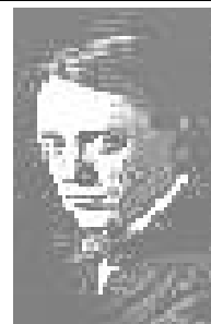
George M. Cohan 1878 -- 1942

Over There, Over There Send the word, send the word, Over There That the Yanks are coming, The Yanks are coming, The drums rum tumming everywhere Sp prepare, say a prayer Send the word, send the word to beware We'll be over, we're coming over. And we won't be back till it's over over there!